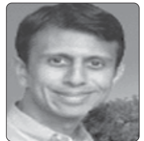
Bobby Jindal will be sworn in as Louisiana's governor on Monday