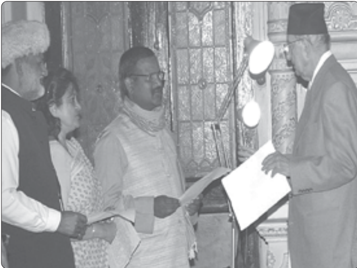
Prime Minister Girija Prasad Koirala administering the oath of office and secrecy to the newly appointed ministers at Singha Durbar on Friday Jan 11, 2008. He appointed seven new faces in his cabinet. Read more on 'PM Expand Cabinet Inducts Seven New Faces'.