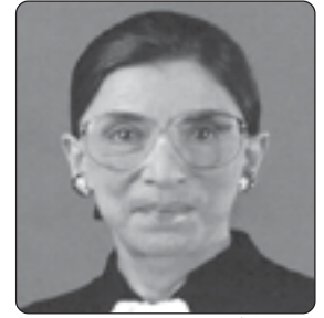
Justice Ruth Bader Ginsburg is the sole remaining female among the nine-member court. She is the second woman to serve on the United States Supreme Court.

Justice Ginsburg is of Jewish parentage and both of her