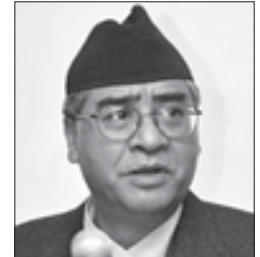
Former PM Sher Bahadur Deuba

Deuba said, "The issues of the Madhes are not so big, but the Maoists should not have thrust spokes in the peace process wheel."